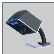
Flex-pole stand MLPN 46-00868