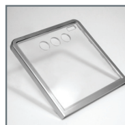
Protective window MLPN 46-00867