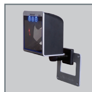
Wall-mount stand MLPN 46-00869